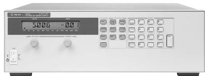
6671A - 6675A