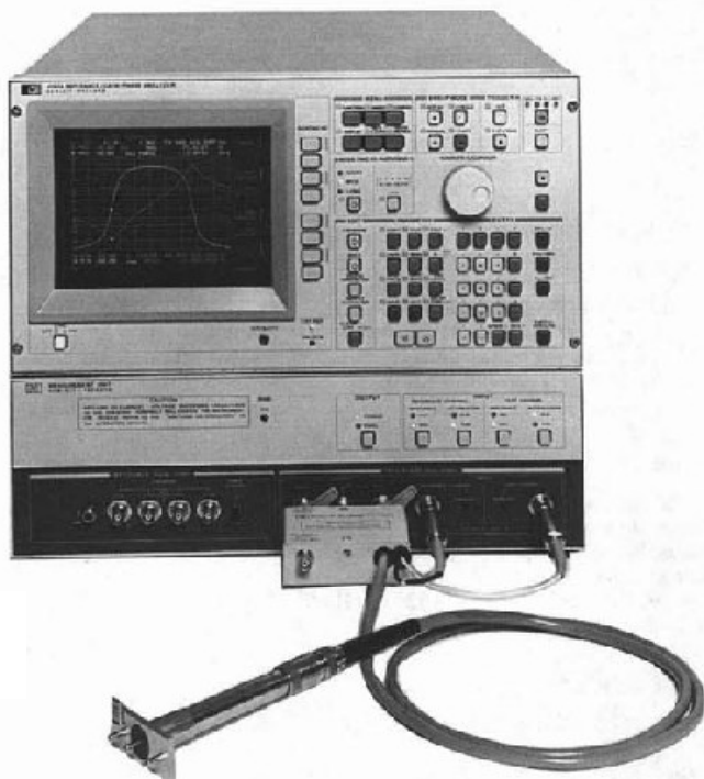
HP 4194A with HP 4194A