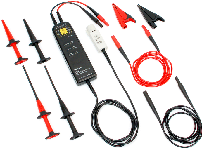
The P52xxA Series probes provide high-voltage differential measurement solutions for any oscilloscope.