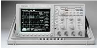
TDS460A 400 MHz, four channel, personal lab scope.

This product is discontinued. View alternative products .