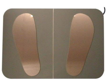
Footwear electrode for separate shoe testing (350 x 500 x 8 mm)