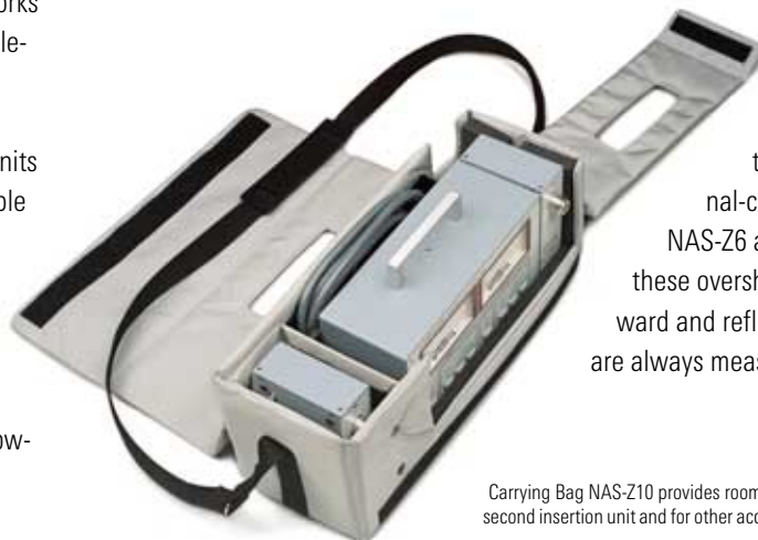
Carrying Bag NAS-Z10 provides room for a second insertion unit and for other accessories

The NAS may also be used for terminated power measurements. For measurements on transmitters, a termination acting as a dummy antenna is connected to the output of the insertion unit. Two models with a load-handling capacity of up to 10 (15) W or 30 (50) W are available.