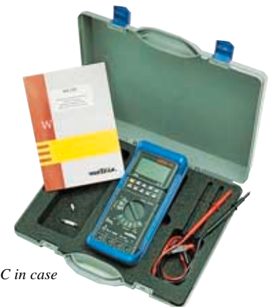
MX 54C in case

With the four models, you can measure true RMS, in AC alone or in AC + DC.