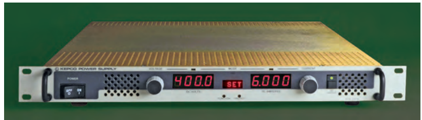
KLR MODEL TABLE