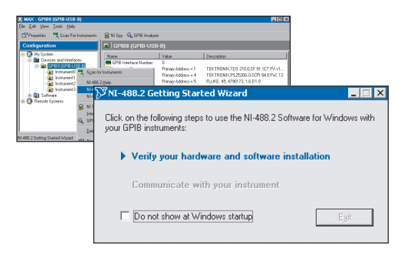
Figure 2. Take these easy steps to get up and running with your instrument communication.