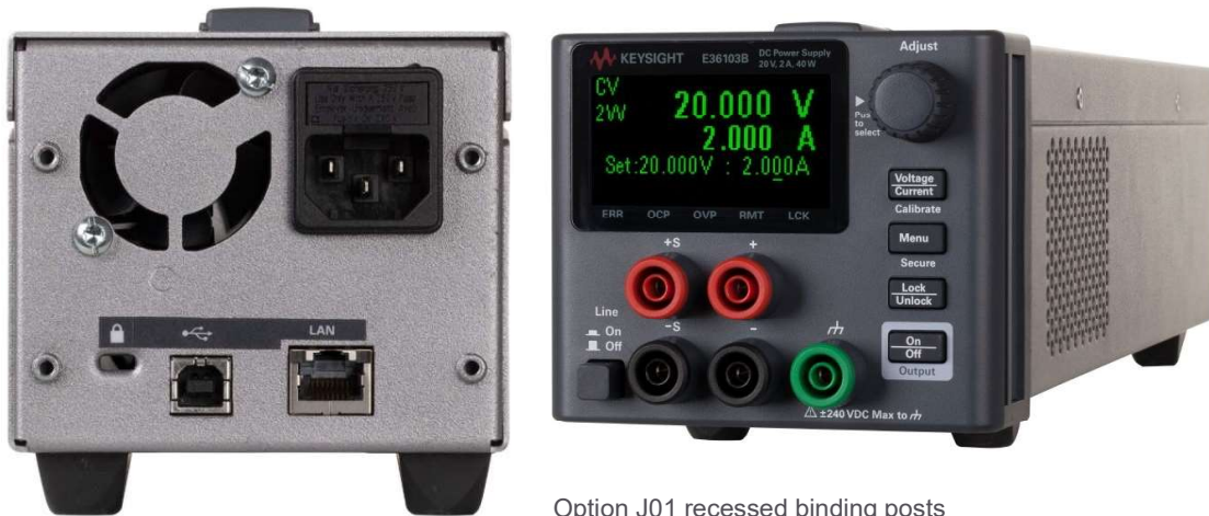
Option J01 recessed binding posts

Connect for computer control with standard LAN (LXI Core) and USB connectivity. Use the security slot to keep the supply on your bench.