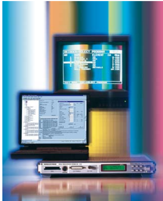
Generation of application-specific transport streams with the optional R&S® DV-ASC Advanced Stream Combiner® PC software

The transport streams include of course all program information and system tables as stipulated by the ATSC or DVB standard. The "Stream Libraries" data sheet (PD 5213.7202.32) offers a detailed overview of supplied and additionally available transport streams.