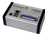
Centronics - USB Converter