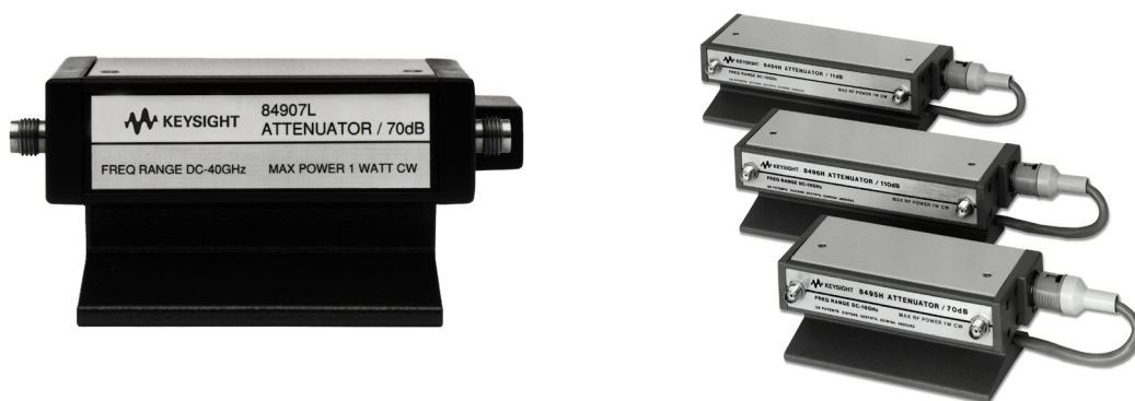
Figure 4. Programmable step attenuators.

Keysight programmable step attenuators offer fast, precise signal-level control up to 50 GHz, with switching time of less than 20 ms. Unmatched attenuation repeatability of less than 0.03 dB up to 5 million cycles per section ensures low measurement uncertainty and reduces calibration cycles when installed into test systems. Automatic GPIB/USB/LAN drive control is achieved with the 11713B/C attenuator/switch driver.