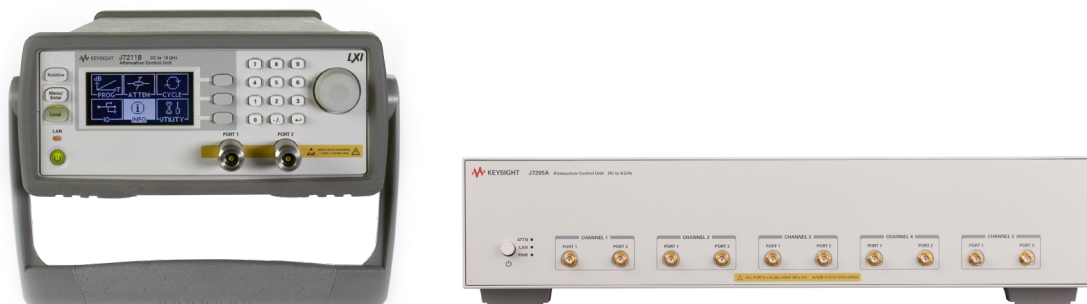
Figure 5. Attenuator control unit.