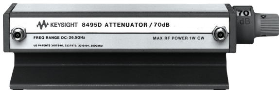
Figure 3. Manual step attenuators.

Keysight manual step attenuators offer fast, precise signal-level control up to 26.5 GHz. Unmatched attenuation repeatability of less than 0.03 dB up to 5 million cycles per section ensures low measurement uncertainty. Attenuation range of 121 dB in 1 dB step can be achieved by cascading 2 attenuators in series.