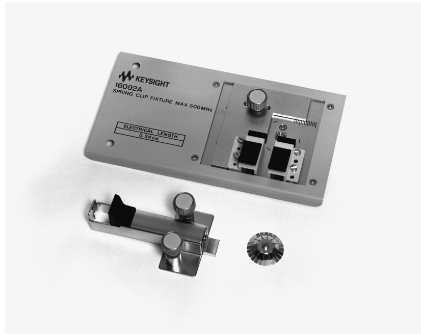
Figure 1-1 16092A Test Fixture

This operating note provides the information required to maintain and repair the 16092A Spring Clip Fixture. The 16092A pictorially shown in Figure 1-1 was specially designed for use with the Impedance analyzer. How to use the 16092A, performance characteristic data, and operating instructions are given in the Impedance Analyzer's operation and service Manual. To order additional copies of this operating note, use the part number listed on the rear cover and contact the nearest Keysight Technologies office.