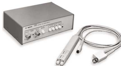
1141A 200 MHz Differential Probe